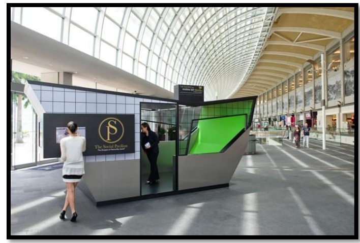
The Social Pavilion at The Shoppes at Marina Bay Sands, Promenade South