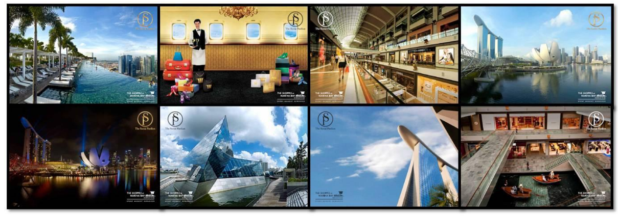
Eight customized backgrounds to choose from

<sup>4</sup> For more information, visit: <u>http://www.marinabaysands.com/Singapore-Shopping/The-Social-Pavilion/</u>